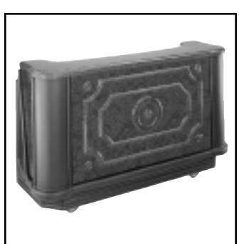
Carmel Decor Combination (669)