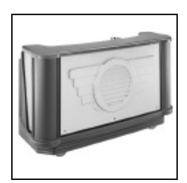
Manhattan Decor Combination (667)