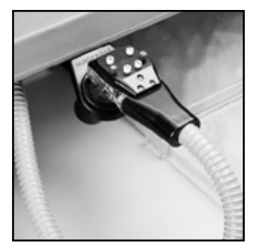
Premium quality 6-button, pre-mix soda gun by Wunder-Bar ^{\circ} .