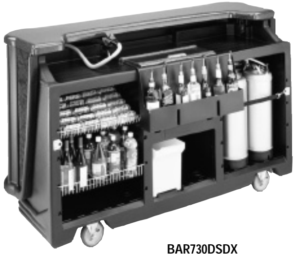
(Shown with optional Wire Shelving)