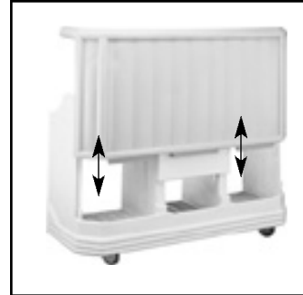
Detachable front foe easy access to inventory and routing lines, tubes and hoses.