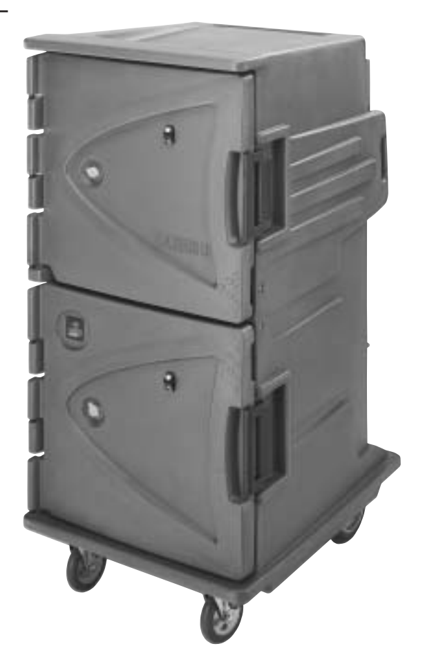
Works without hot coil or humidifier!