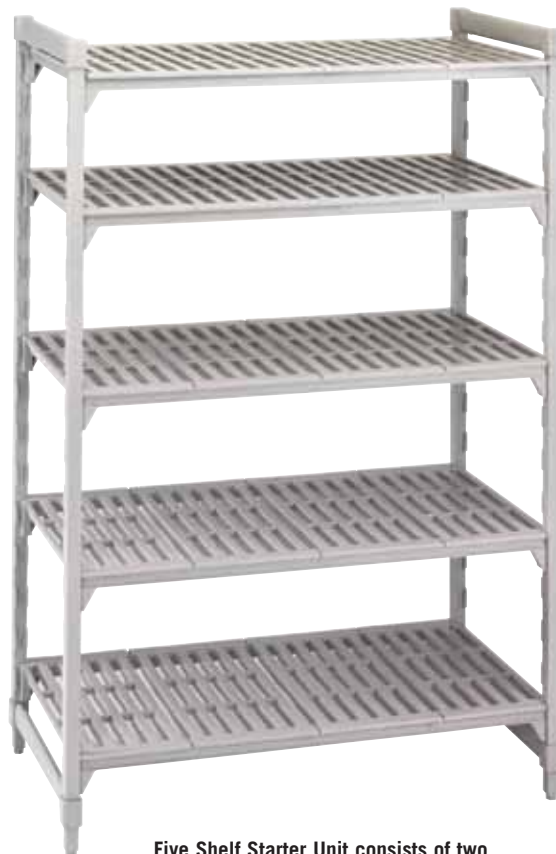
Five Shelf Starter Unit consists of two Post Kits and five Vented Shelf Kits.