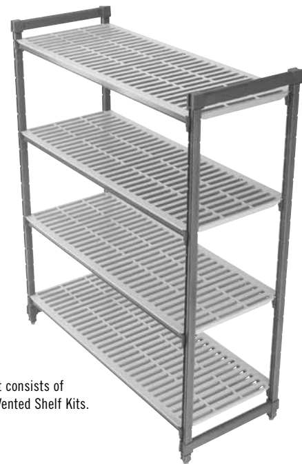
Four Shelf Add-On Unit consists of one Post Kit and four Vented Shelf Kits.