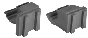
Set of Left and Right Corner Connectors (1 set required per shelf).