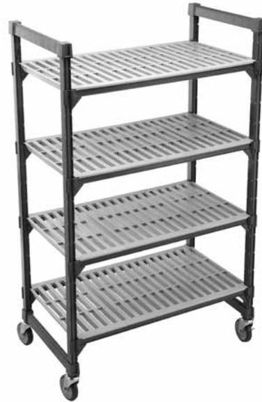
Mobile Four Shelf Unit with Vented Shelf Plates. (Built using 2 Mobile Post Kits and 4 Mobile Shelf Kits.)