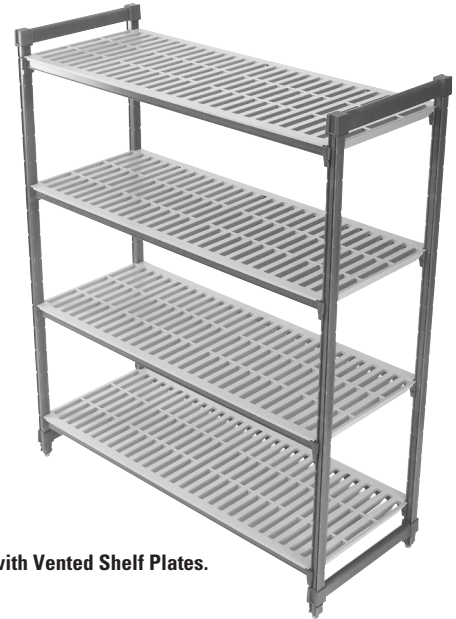
Four Shelf Unit with Vented Shelf Plates.