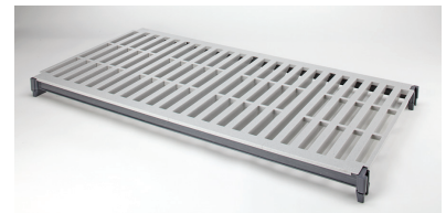
Vented Shelf Kit includes two Traverses and Vented Shelf Set for one shelf.