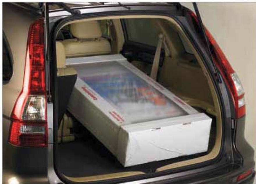
Package conveniently fits into the trunk or back seat of most sedans or mid-sized vehicles.

Includes: 1 top and 1 bottom split post set with leveling feet installed, pre-assembled with post connectors, wedges, post threaded inserts, stationary traverse dovetails (16A and 16B), vented shelf plates (for 4 shelves), 8 stationary traverses and instructions.