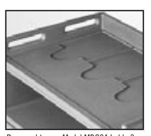
Recessed top on Model MDC24 holds 3 each, 1 gal. (3,8 L) Camtainers and stacked Condiment Bins.