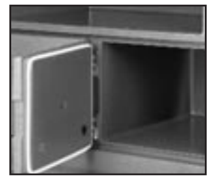
Closed compartments also hold supplies.