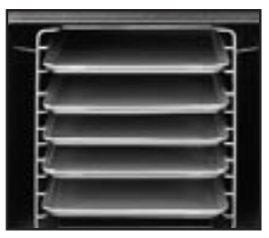
Organize Food Pans and Trays by placing the Optional Wire Rack inside the insulated compartments.