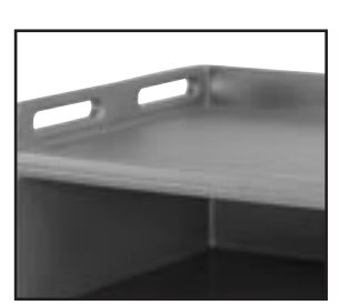
Model MDC24F has a flat top counter to allow menu service flexibility.