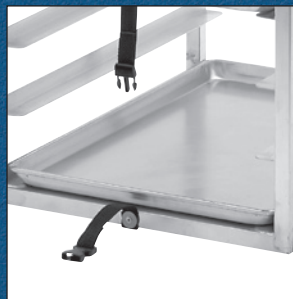
/015 Pan Stop Web-Strap