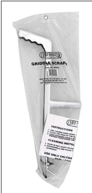
Item No: 90002