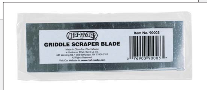
Item No: 90003