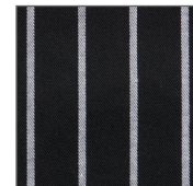
BCS (black chalk stripe)