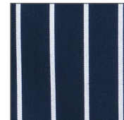
NCS (navy chalk stripe)