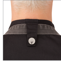
back collar apron holder