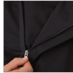
two-way separating zipper