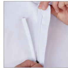
two-way separating zipper