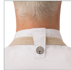
back collar apron holder