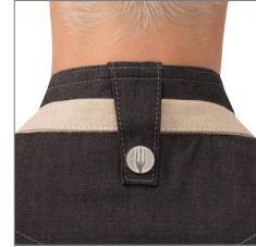
back collar apron holder