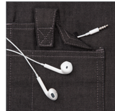
hidden earbud access