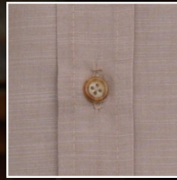
faux horn buttons