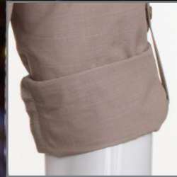
rolled sleeve detail