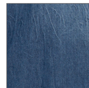
IBL (indigo blue)