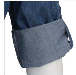
rolled sleeve detail