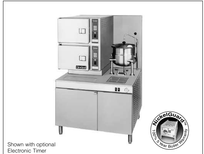
Shown with optional Electronic Timer