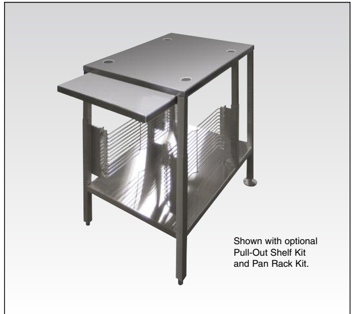
Shown with optional Pull-Out Shelf Kit and Pan Rack Kit.