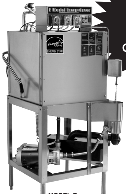
MODEL E AVAILABLE IN STRAIGHT AND CORNER MODEL

USES ONLY .93 Gallons Of Water Per Cycle!