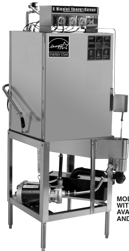
MODEL E EXT WITH 20-1/2" DOOR OPENING AVAILABLE IN STRAIGHT AND CORNER MODEL