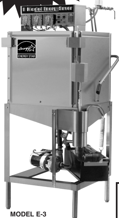
MODEL E-3 (3 DOORS OPEN) AVAILABLE FOR STRAIGHT THROUGH AND CORNER OPERATION.