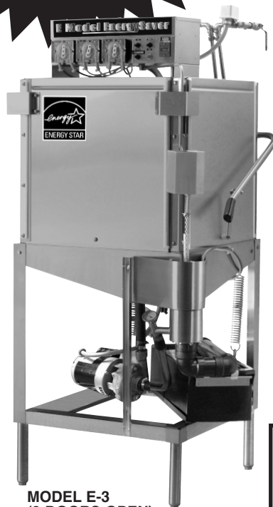
MODEL E-3 (3 DOORS OPEN) AVAILABLE FOR STRAIGHT THROUGH AND CORNER OPERATION.