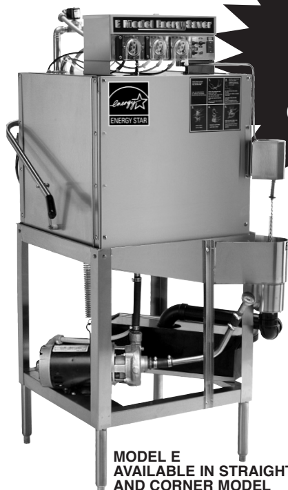
MODEL E AVAILABLE IN STRAIGHT AND CORNER MODEL

USES ONLY .93 Gallons Of Water Per Cycle!