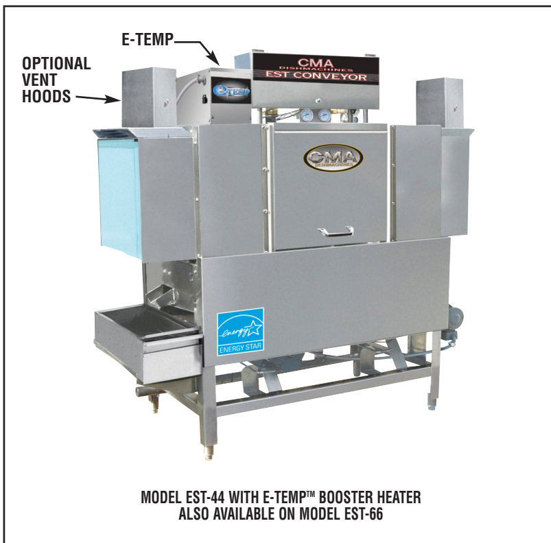
MODEL EST-44 WITH E-TEMP™ BOOSTER HEATER ALSO AVAILABLE ON MODEL EST-66