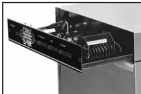
"Work-in-a-drawer", may be removed.