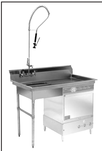
Optional dishtable and faucet.