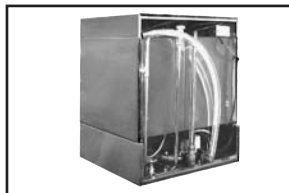
Pumped drain will drain uphill. Requires no floor drain.