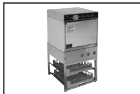
The optional Universal Pedestal has a storage feature for spare dishracks, with the ability to store two empty dishracks beneath the machine. 15-1/4"H X 24"W X 25-1/4"D.