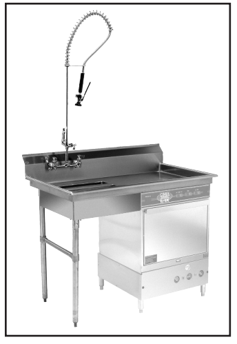
Optional dishtable and faucet.