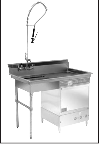
Optional dishtable and faucet.