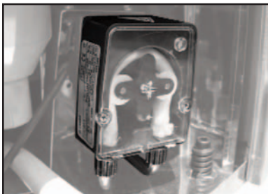
Built-in detergent and rinse chemical pumps.