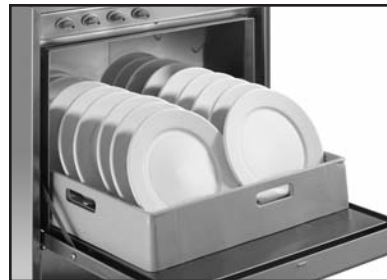
Large 13-3/4" door clearance accommodates oversized plates, glasses and utensils.