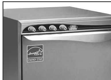
Top mounted controls are easy to read and simple to operate.