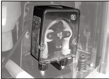
Built-in detergent and rinse chemical pumps.