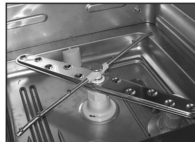
Upper and lower wash and rinse arms guarantee excellent results.