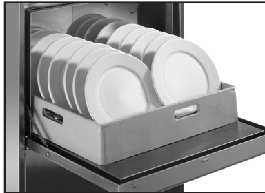
Large 13-3/4" door clearance accommodates oversized plates, glasses and utensils.