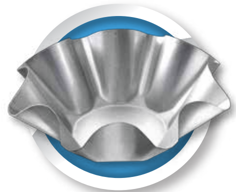
Tortilla Shell Pan Coated with AMERICOAT® Plus