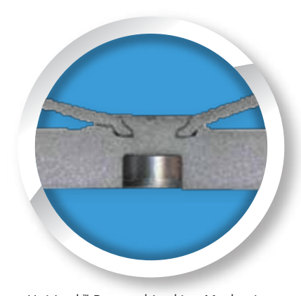
Uni-Lock™ Patented Locking Mechanism