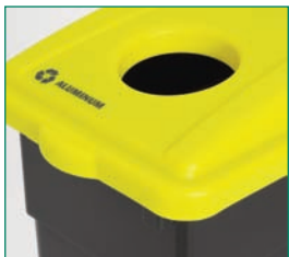
Wall Hugger™ Recycle Lids come with trilingual (Eng/Sp/Fr) "Recycle Material ID Labels" to make sorting easy!