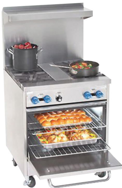
Model F326 (shown with extra rack & optional casters)