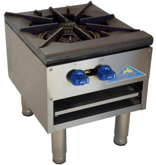
Model SRSP18-1 / TH-RB-1