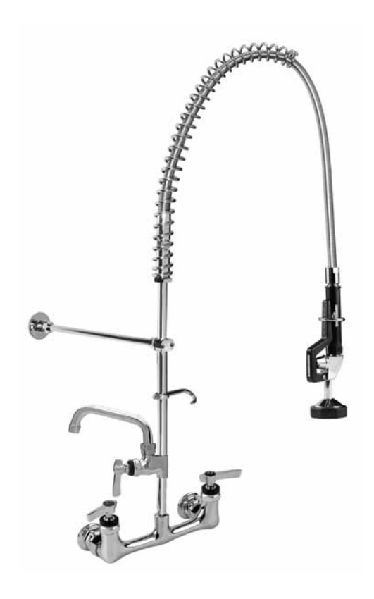
Approximate shipping weight - 13 lb Warranty - 2 years parts on faucet and spray valve

Heavy duty pre-rinse assembly designed to withstand the demands of commercial operations.