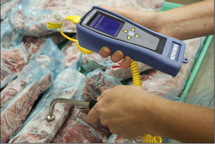
Use the Handheld to check incoming food product to ensure compliance with your HACCP workflow.