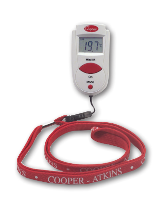
470 Mini Infrared