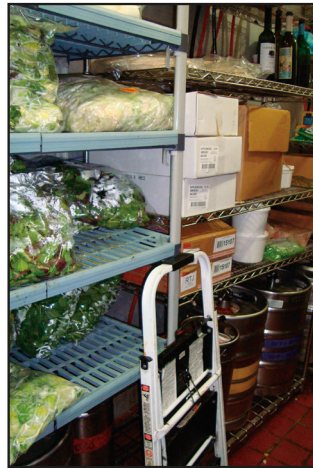
WALK-IN FREEZERS / REFRIGERATORS