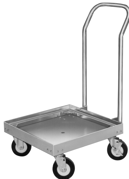
500-2020 (Shown with accessory handle)