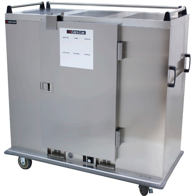
EB-150-A (Shown with accessory options)