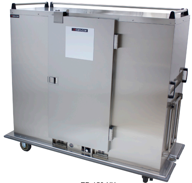
EB-150-XX (Shown with accessory options)