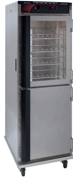
H-138-NS-CC3MCQ (Shown with optional extra wire shelf)