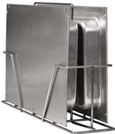
Accessory Carrier #0645-003