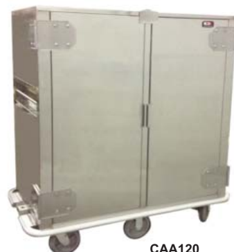
CAA120 shown with optional tow hitch

* Capacity varies according to tray size. Trays NOT included. Contact individual manufacturers for trays. SAMPLE TRAY(S) REQUIRED WITH ORDER. ** Optional tray racks required.