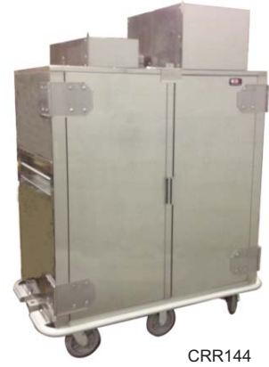
CRR144 shown with optional tow hitch