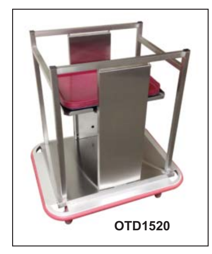
OTD: ALL STAINLESS STEEL TUBULAR FRAME... Heavy-duty stainless steel frame with stainless steel bottom and tray platform.

ETD & OTD BUMPER: Full perimeter, non-marking red vinyl bumper set in heavy-duty 3/16" thick extruded aluminum frame. Protects doorways, walls and cart from damage.