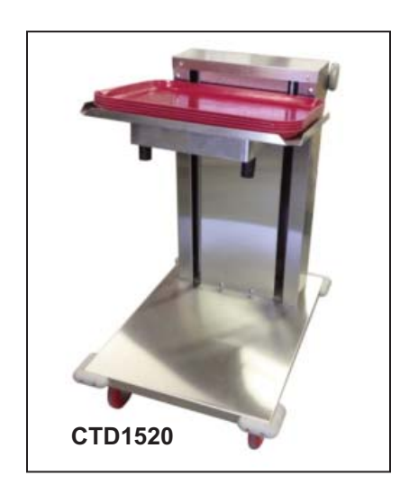
CTD: ALL STAINLESS STEEL... Heavy-duty stainless steel lowerator housing with stainless steel bottom and tray platform.

ETD & OTD BUMPER: Full perimeter, non-marking red vinyl bumper set in heavy-duty 3/16" thick extruded aluminum frame. Protects doorways, walls and cart from damage.