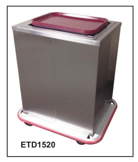
ETD: COMPLETELY WELDED TURNED-IN SEAM CONSTRUCTION... All stainless steel construction. Adds rigidity to entire cabinet for maximum durability and reliable performance, and eliminates raw edges for easy cleaning and safety. Sleek exterior styling is easy to clean.

Since 1947, foodservice equipment that delivers!