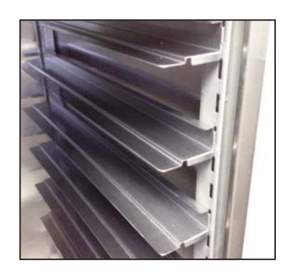
TRAY RACKS ... with adjustable pin positions to accommodate a variety of tray sizes. Tray spacing is adjustable on 1.75" centers. Standard spacing is 5.25".

Since 1947, Foodservice Equipment That Delivers!