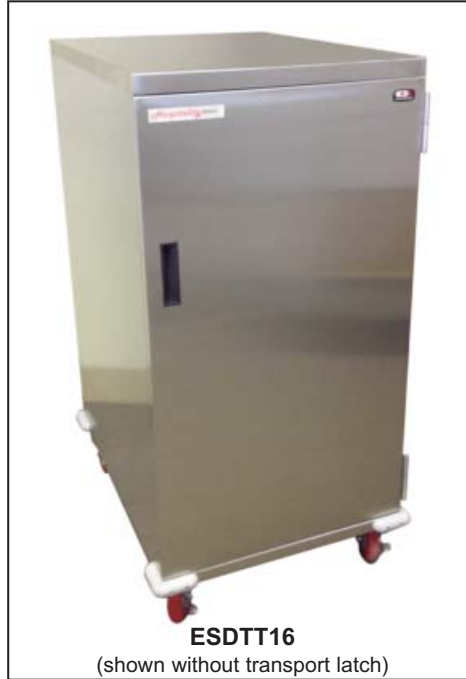
ESDTT16 (shown without transport latch)

Since 1947, Foodservice Equipment That Delivers!