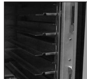
Optional stainless steel adjustable universal slides