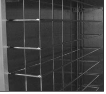
Standard fixed universal wire slides

PAN SLIDES... Universal wire slides at fixed spacing of 3". Assemblies removable. Hold 18"x26" sheet pans, 12"x20" steam table pans, 2/1 or 1/2 G/N pans. Adjustable universal stainless steel pan slides or fixed angle pan slides are optional.