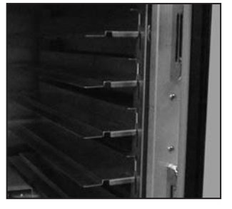
Optional stainess steel adjustable universal slides