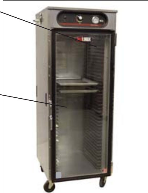
HL8-18 (shown with optional clear door & fixed angle tray slides)

EASY-TO-USE DIGITAL CONTROLS... Control heat with dial. Temperature range of 85°F to 200°F. Flashing display during preheat mode, turns solid when preheat mode is complete. Temperature display shows user setting. Press temperature dial to display actual temperature. Low temperature light with audible alarm.