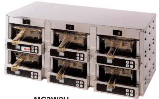
MC3W2H (shown with optional pans)