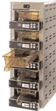
MC1W5H (shown with optional pans)